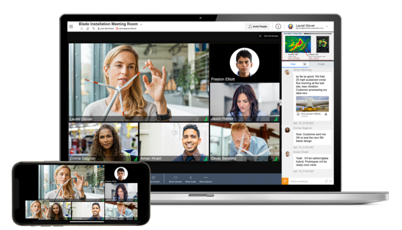
Figure 1: Avaya Spaces in action, featuring meetings and chat.

Avaya Spaces puts the focus on the work, not on the modality. With a completely revamped set of features, including chat and file sharing, Avaya goes beyond the heritage of meetings. Many offerings focus on either messaging or meetings. The integration component is often an afterthought.